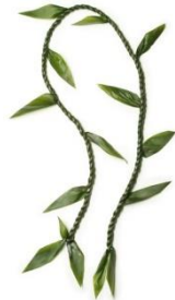
Single Ti Leaf