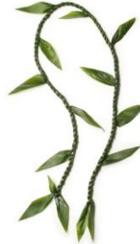
Single Ti Leaf